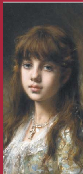
The Young Girl by Alexei Alexeievitch Harlamoff (Russian, 1840-1925), c1870, oil on canvas, 19 x 13ins