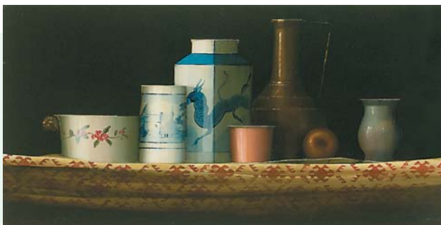
Still Life with Pewter Tankard