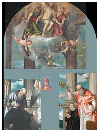
The reconstructed Veronese Altarpiece